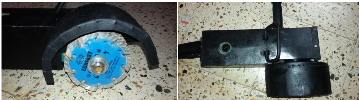
Fig 5. Dust Cover

Dust cover is made of mild steel material. Which is act as safeguard for user from dust while using machine.