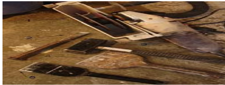
Fig.1 Conventional Tools

Cutting a chase is a simple job and most electricians will own a chasing tool. The chasing tool seen in the image below is basically an angle grinder. [1]