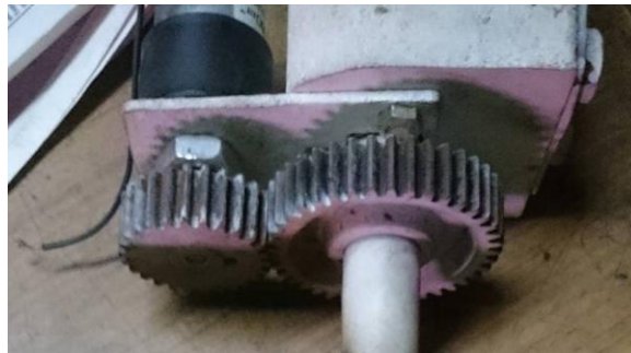
Fig.5 Gear assembly

As the idea of “Custom angle ceiling fan” is of a new type, we are looking forward for taking a patent. We are also planning to install an auxiliary PCB to control the fan via remote control. This makes controlling the fan, more user friendly. Analysis of blade angle can also be done that gives the optimum angle under which fan works so efficiently and effectively. Here, we have used a small blade length ceiling fan of 1200mm sweep. By calculation we found that, the safe angle by which the ceiling fan can be tilted is at 50°.