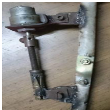
Fig.4 Threaded link mechanism

The Custom angle ceiling fan, is a special type of ceiling fan that helps us to customize the angle of the down-rod of the ceiling fan, as per our interest. By changing the angle of the down-rod, we can actually change the direction of the air flow into a specific area of our interest. This new idea came across, when we saw ceiling fans wasting lots of energy by blowing air into areas, where it's not needed, or to an area which is much larger or smaller than actually required. All these difficulties including higher power consumption, can be reduced by the Custom Angle Ceiling Fan.