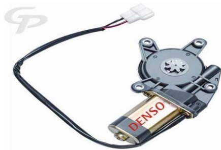
Fig.3 Geared DC Motor 2 (150 RPM)