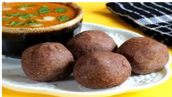
Fig 1. Ragi Mudde

Ragi mudde has only two ingredients, the Ragi flour and water. A known quantity of water is boiled in a wide mouthed vessel. And Ragi floured is poured gradually into boiling water.